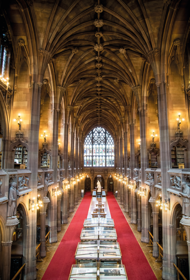
The John Rylands Library